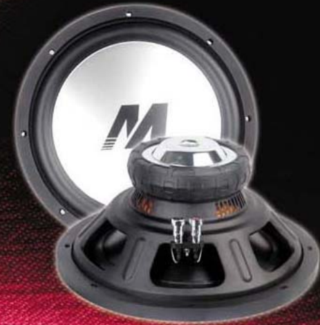
Stamped Basket PP Cone With Rubber Edge