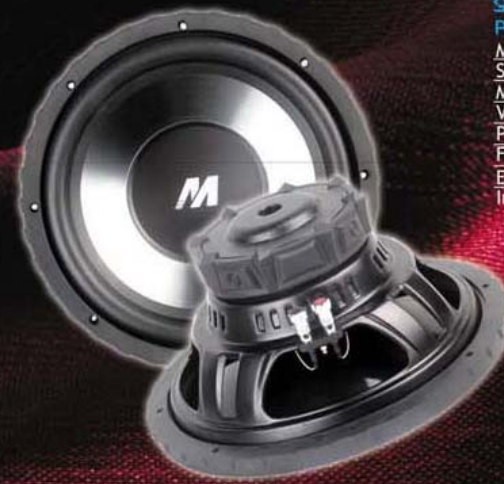
Stamped Basket PP Cone With Rubber Edge