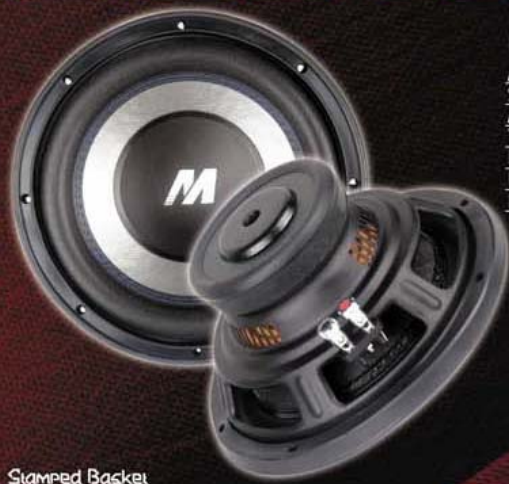
Stamped Basket Non-pressed Paper Cone With Foam Edge