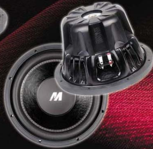
Stamped Basket Paper Cone With Rubber Edge