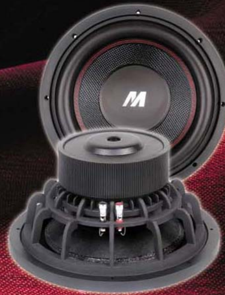
Die-casting Basket Non-pressed Paper Cone With Foam Edge