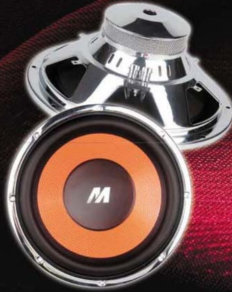
Stamped Basket Non-pressed Paper Cone With Foam Edge