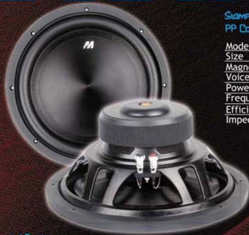
Stamped Basket PP Cone With Rubber Edge